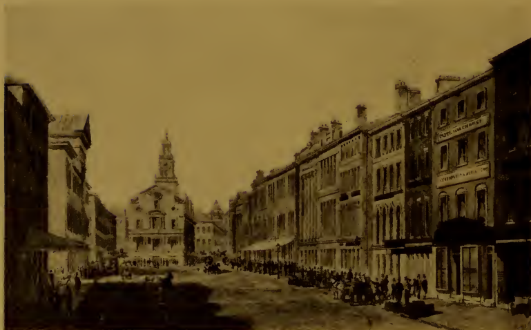
State Street in 1835